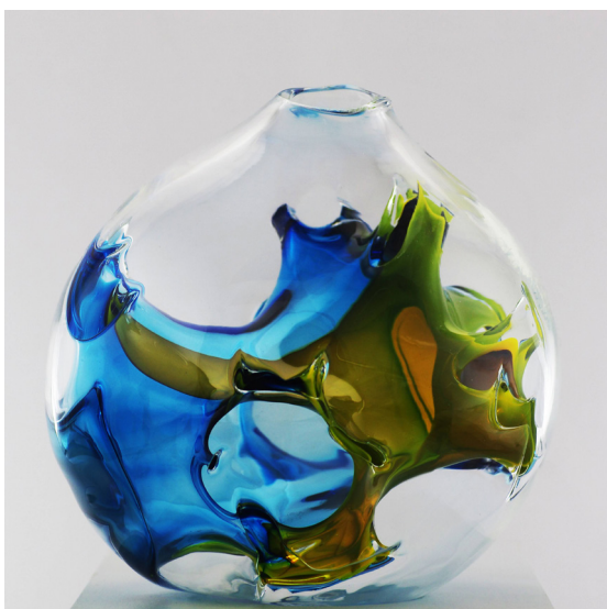
Stijn Wuyts, « Inner space », 2020